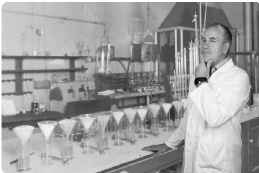
Figure 1; I should know, I was there.

This is when the activity-based, universal healthcare system under Medicare was launched. This system catapulted Australia to near the top of the global healthcare rankings.